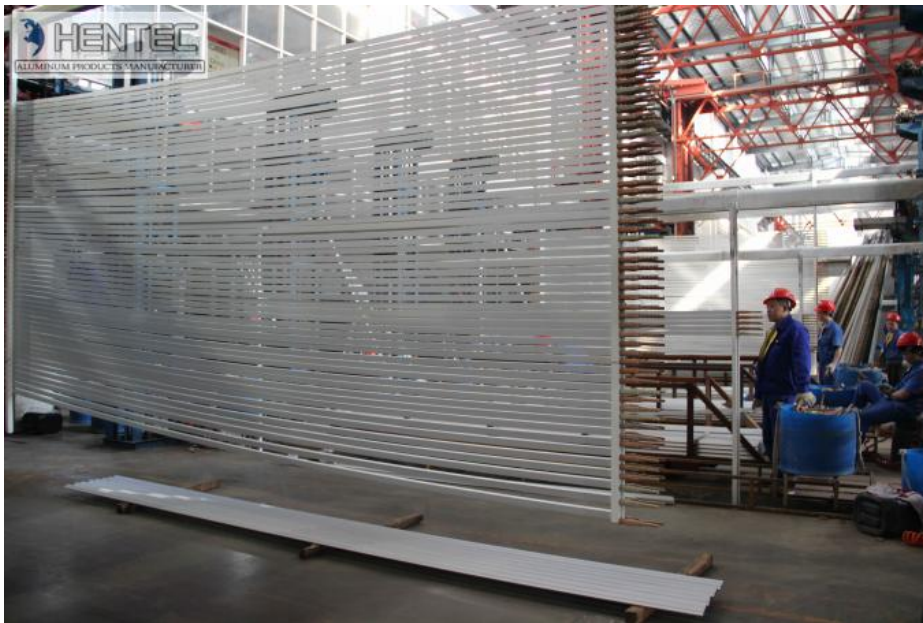
Powder Sparying Workshop