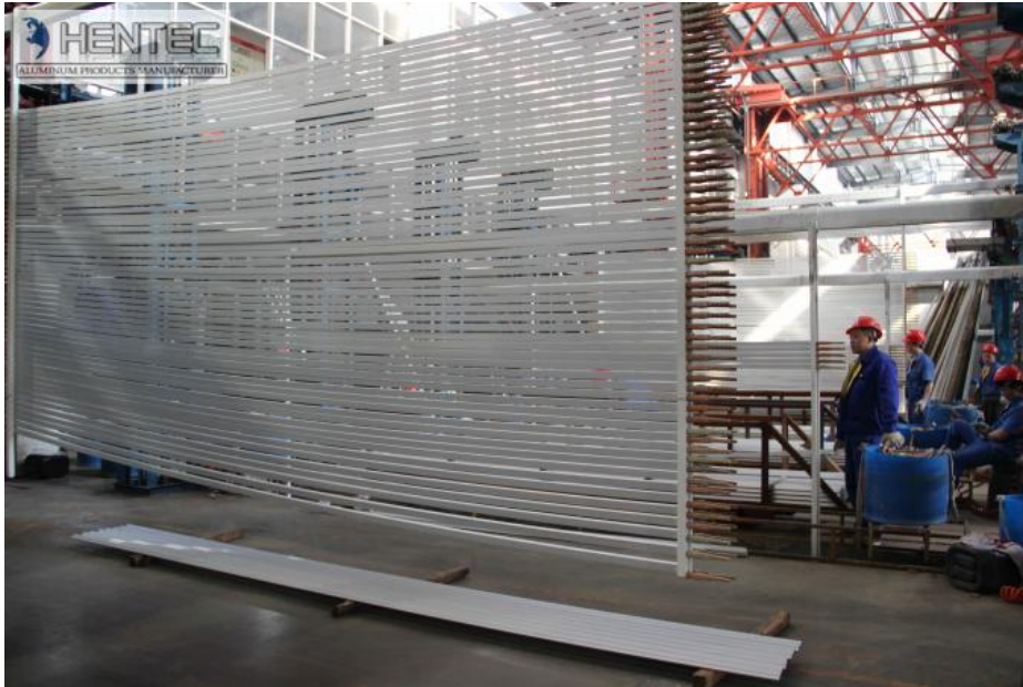
Powder Sparying Workshop

Hentec has 6 units aluminum oxide surface treatment production line .