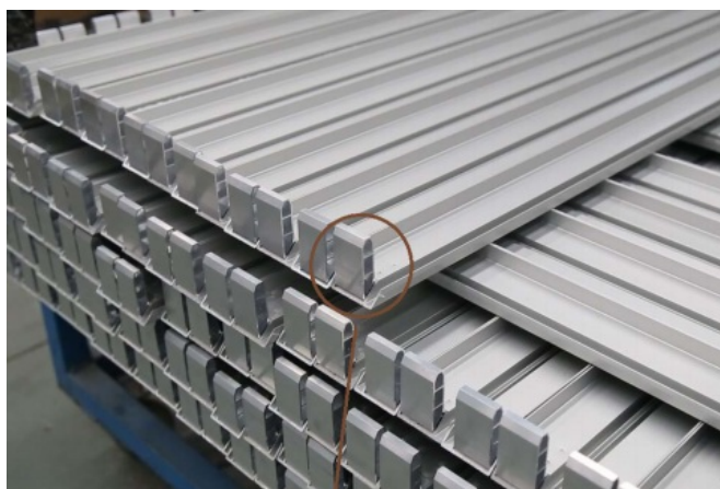
The Corner Key has been installed before packing .

We will install the Corker Key to two short side , it will be very easy to install after you receive the goods .