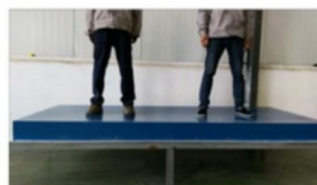
No deformation with 140KG