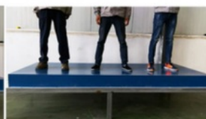
No deformation with 210KG