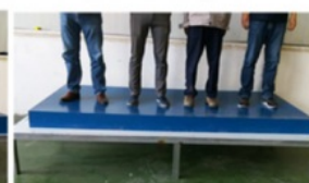
No deformation with 300KG