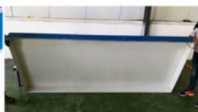
Box made of 1300 x 2700mm