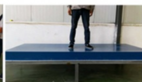
No deformation with 62KG