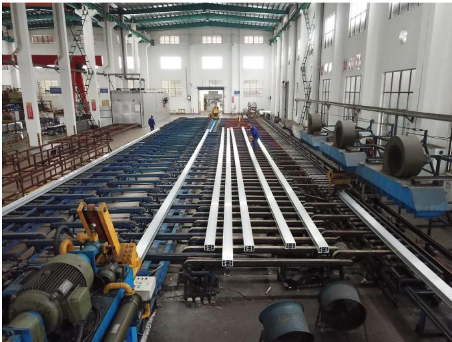
Anodizing Line :