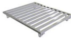
Fully Nestable Aluminum Pallet