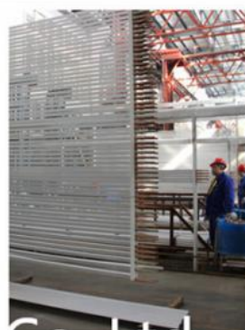
Hentec Industry Co.,Ltd