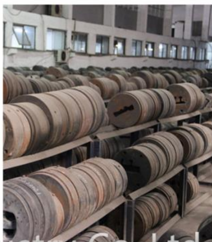
Hentec Industry Co.,Ltd