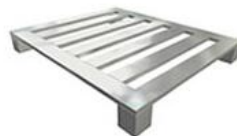
4-Way Big Block Open Bottom Aluminum Pallet