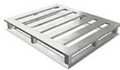
Standard 4-Way Block Aluminum Pallet