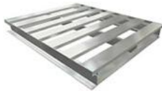
2-Way Heavy Duty Channel Aluminum Pallet