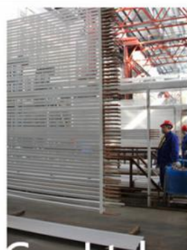
Hentec Industry Co.,Ltd