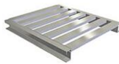
2-Way Heavy Duty Rail Aluminum Pallet