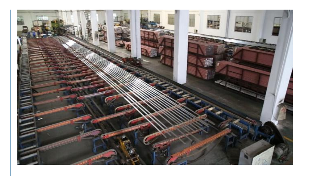
Hentec has 6 units aluminum oxide surface treatment production line .