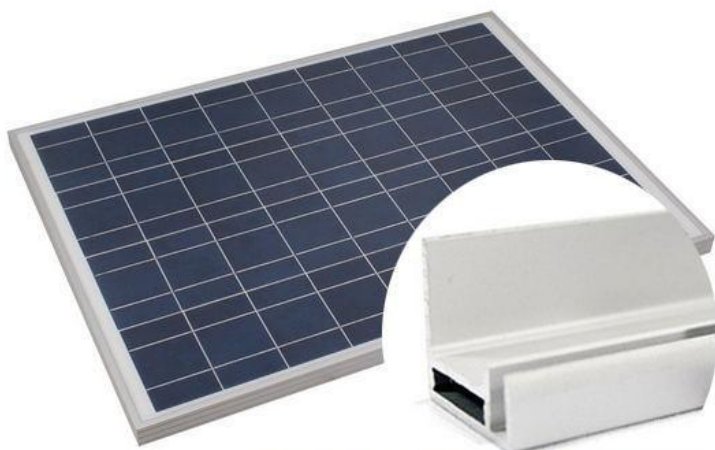
We Supply The Quality Aluminum Solar Panel Frame