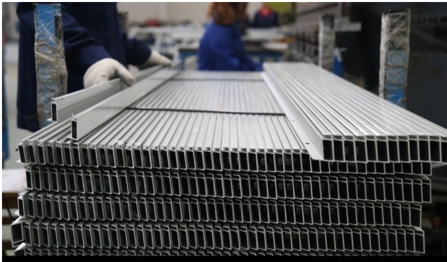
Our Casting Workshop