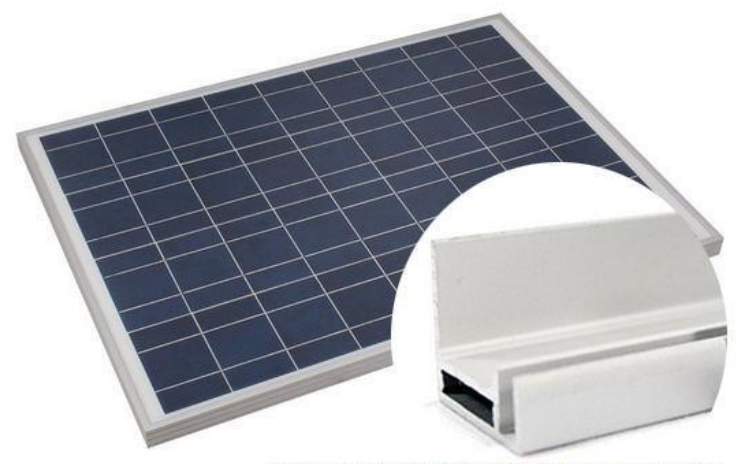
We Supply The Quality Aluminum Solar Panel Frame