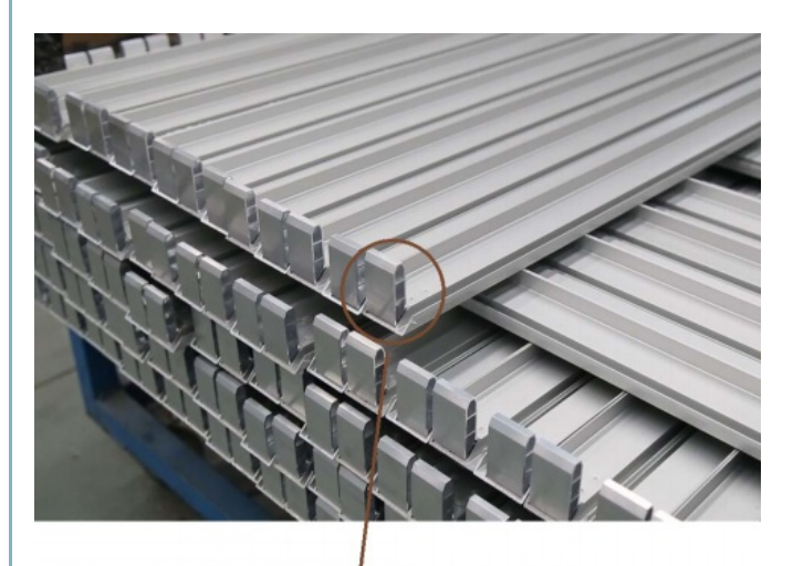
The Corner Key has been installed befor packing.

We will install the Corker Key to two short side , it will be very easy to install after you receive the goods .